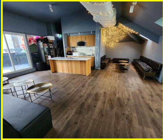
Main Bar & Party Nook