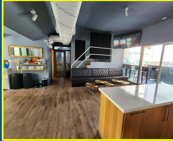
Main Bar & Large Balcony